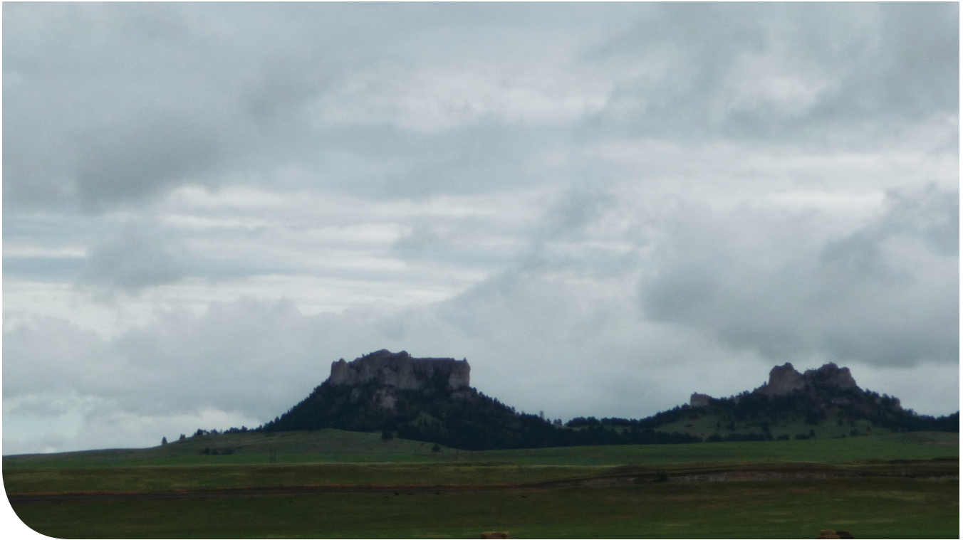
Cameco's uranium mine sits at the base of Crow Butte, a sacred Lakota site.