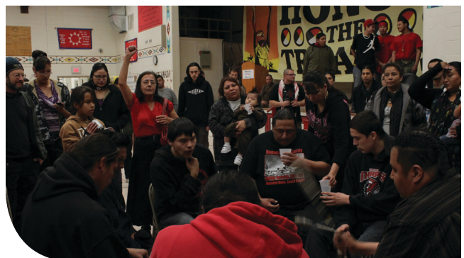
The Oyuh'pa Singers of Manderson, S.D., sing for the protection of water.