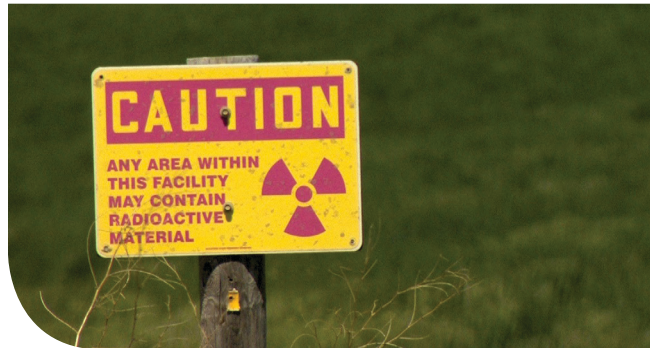
A sign across the street from a local rancher warns passerby at the boundary of Cameco's Crow Butte mine in Crawford, Neb.