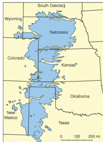
Pictured Left: Map of U.S. Aquifers